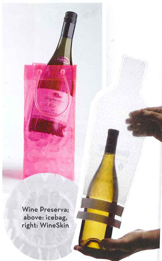
Wine Preserva; above: icebag, right: WineSkin

Now, these are cool... as will be your wine. These new wine icebags from France offer a snappy, casual means of keeping your summer drop at the right temperature. Available at gift shops ($9.95-$14.95) or from brightidea.co.nz ❖ JOHN SAKER